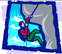
Activity D.5 On Belay

Game Objective: The first team to get all of its Mountain climbers to the top wins.